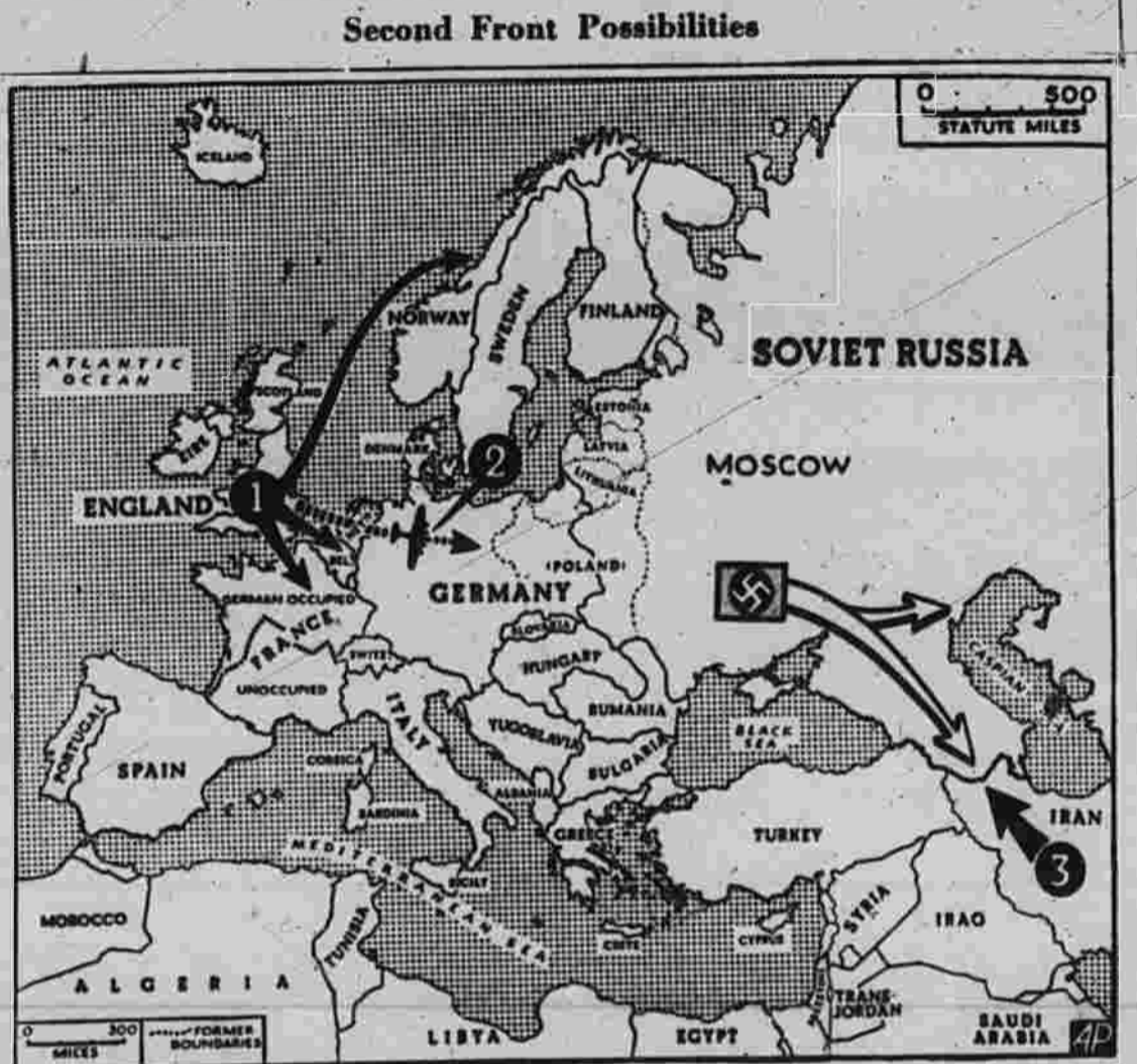
Speculation in London of possible American-British moves to aid Russia as a result of the Churchill-Stalin conference in Moscow. Invasion of Norway to safeguard the Murmansk supply route or invasion of Europe to ease the strain on the Red Army (1); increase of air attacks on Germany (2). Indications that the Caucasus and Iran (3) might become a main theater of war were seen in the presence of Gen. Sir Archibald Wavell, British commander in India, at the conference.

Washington, Aug. 19.—(AP)—W. S. Farish, president of The Standard Oil Company (New Jersey) declared today that "half of the bombs we are dropping on Axis and Nazis" were made possible by the research growing out of his company's pre-war patent relations with I. G. Farbenindustrie, German chemical trust. "All of you know how the enormous advantages to the public of our contracts with I. G. Farbenindustrie," he told the Senate Patents Committee. "The United States got far more from Germany than Germany ever received from us." Farish read a 20-page statement before the committee replying to Justice Department criticisms of his firm's patent pooling arrangements with the German trust. He contended that statements made before the committee by representatives of the Justice Department were based on misinterpretation of the contract, bolstered by selected material from his company's files. The case which the witnesses attempted to build against Standard Oil Company is a "jerry-built house," he said. "And the foundation of mud upon which the whole thing rests is the assumption that the executives of our company—representing a typical cross-section of America, some veterans of the last war, some now in the armed forces, some with sons now